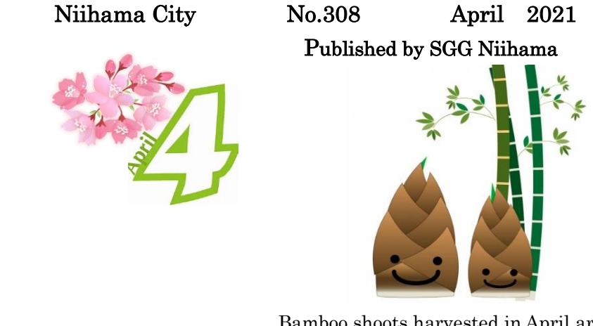
Bamboo shoots harvested in April are said to be the king of spring taste.