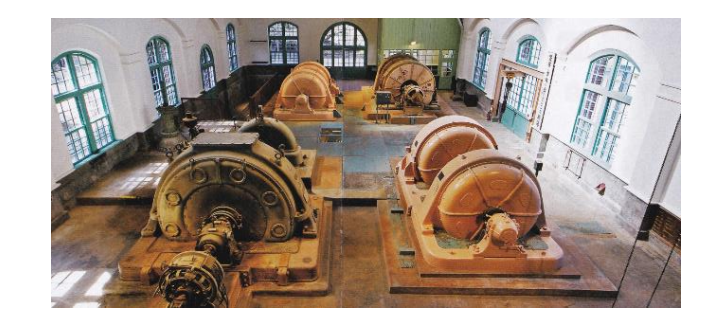
Open: 9:00 AM-5:00 PM Free Admission

Aseismic reinforcement for the building began in 2018 by Niihama city, and the building was finally open to the public on Tuesday, March 28th. Inside the building, a hydroelectric generator made by German maker Siemens AG is on display, just as it had been when the original building was founded, and you can take a tour through the traces of the penstocks and spillway. You can learn about the history of the power plant and its historical significance.