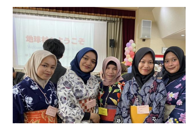
The Number of the Participants

I am excited to join again next year, Many thanks to the Global Party organizer team for such a wonderful event.